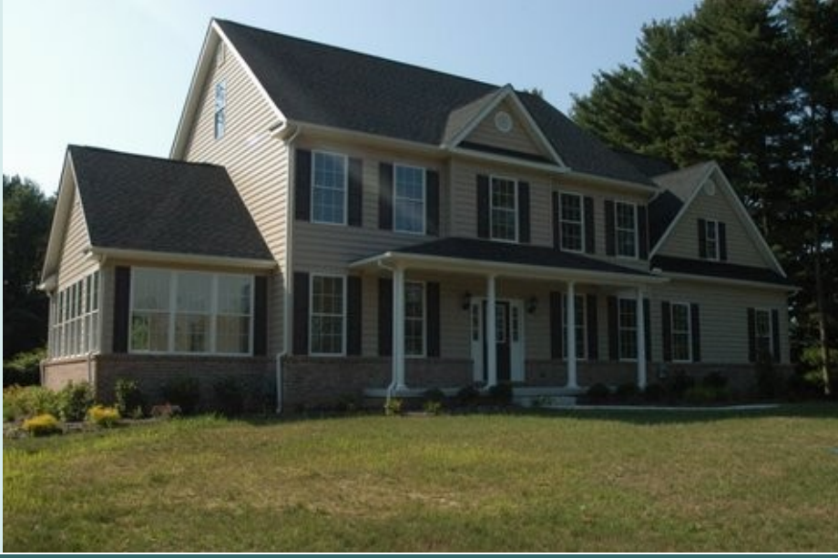
The Drawyer's Grandview Model

The Drawyer's Grandview is a colonial home with a formal dining room, living room as well as a great room and spacious sunroom. With many options available the list is too lengthy show them all. Some of the most popular include hardwood floors, custom kitchen choices, a gas fire-place and finished basement to mention a few. This home is perfect for an added walkup attic for additional living space. This model comes standard with a second floor laundry and multiple walk in closets. The base model is a 4 bedroom home with 2.5 baths. The front elevation can be done in Stone, Brick, Siding or a combination of all three. We welcome your custom revisions! Please inquire with one of our sales staff for more information and options. (The Drawyer's Grandview Model requires a wider lot than normal due to the width of the home)